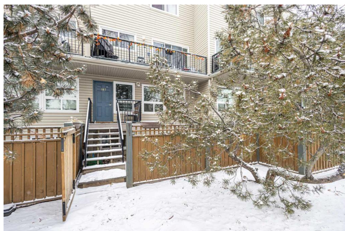
107-3615 49 St NW, Calgary, AB

Main Building: Total Exterior Area Above Grade 404.85 sq ft